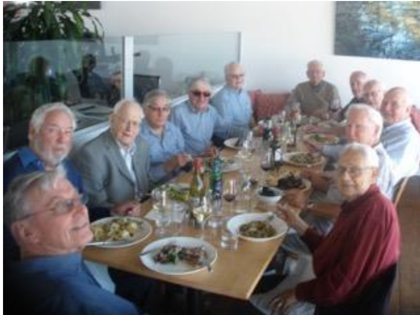
Past Probus Presidents all looking fit and well.

We would like to make this an annual event in order to maintain ties with former presidents who do not always get the opportunity to attend our monthly meetings.