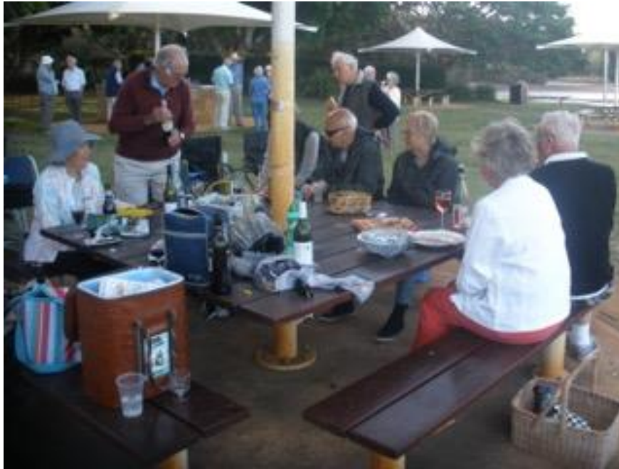
You meet the nicest people at a Pittwater Probus BBQ.

If you enjoy good company in a relaxed setting make sure you join us at the next BBQ.