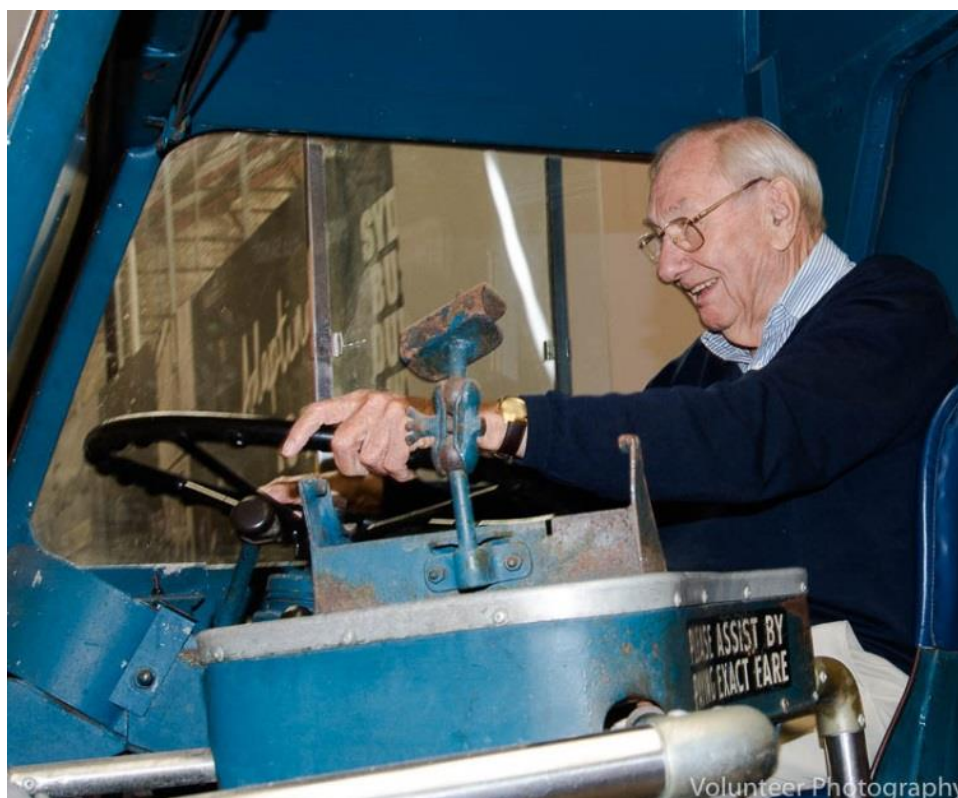
I've always wanted to drive a bus !