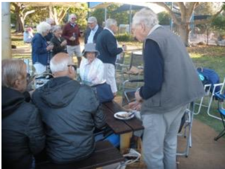
This beats dining at the Ritz !