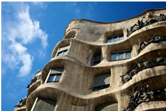
Casa Milo Apartments, Barcelona

Increasingly pious, after 1910, Gaudí abandoned nearly all other work to focus on the Sagrada Familia. While employing Gaudí's equilibrated methods, the church would borrow from the cathedral-Gothic and Art Nouveau styles but present them in a form beyond recognition. Gaudí died while still working on the Sagrada Familia on June 10, 1926, in Barcelona, Spain. While the structure remained unfinished at his death in 1926—only one transept with one of four towers was built—the extraordinary structure has a final completion target date of 2026, to mark the 100th anniversary of his passing.