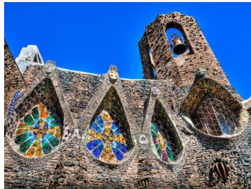
Church at Coloma de Carvello

Frank Gehry is a Canadian-American architect known for postmodern designs, including the Walt Disney Concert Hall and the Guggenheim Museum in Bilbao, Spain. Frank Gehry is considered one of the most relevant and influential architects in the world. The Guggenheim Museum Bilbao is one of Frank Gehry's most celebrated works.