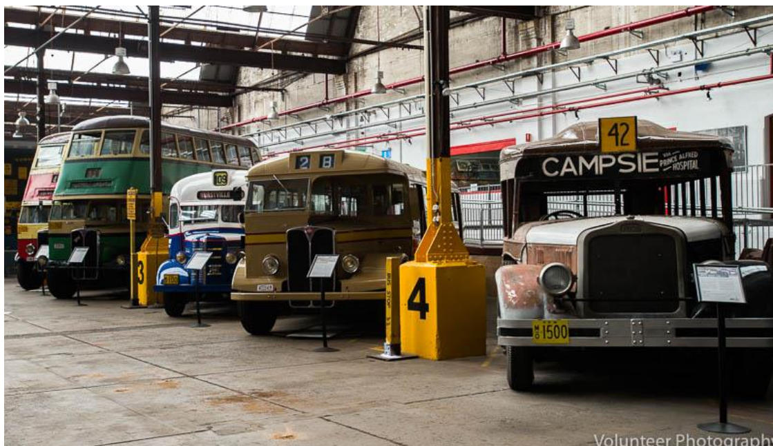
A part of the impressive display at the museum.

On November 2, 2016 a number of Probus Members visited the Bus & Tram Museum in Leichhardt organised by Barrie Unsworth. The visit included a ride in a vintage bus over Gladesville Bridge and onto Hunter's Hill and back, complete with bus tickets.