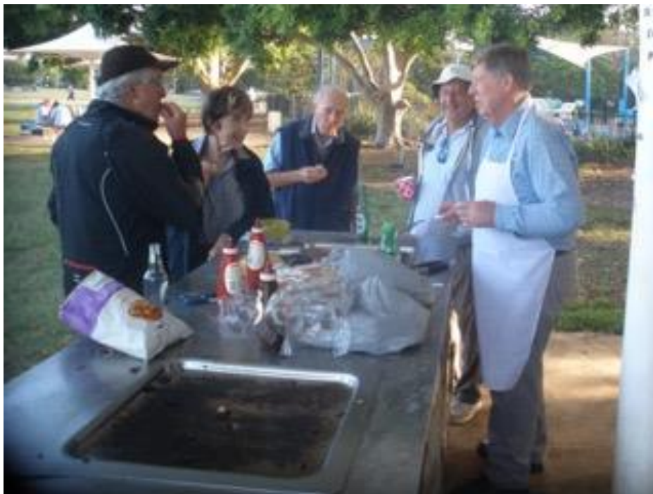
The secret is in how you turn the sausages.