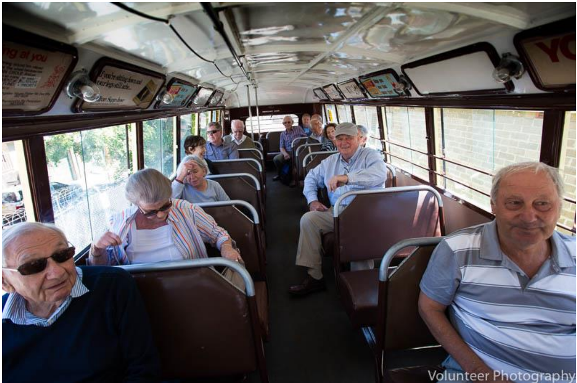
The team takes to the road.