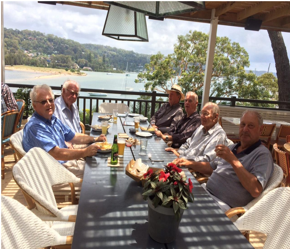
The Pittwater Probus Investment Group hard at work planning the 2017 Investment Strategy.