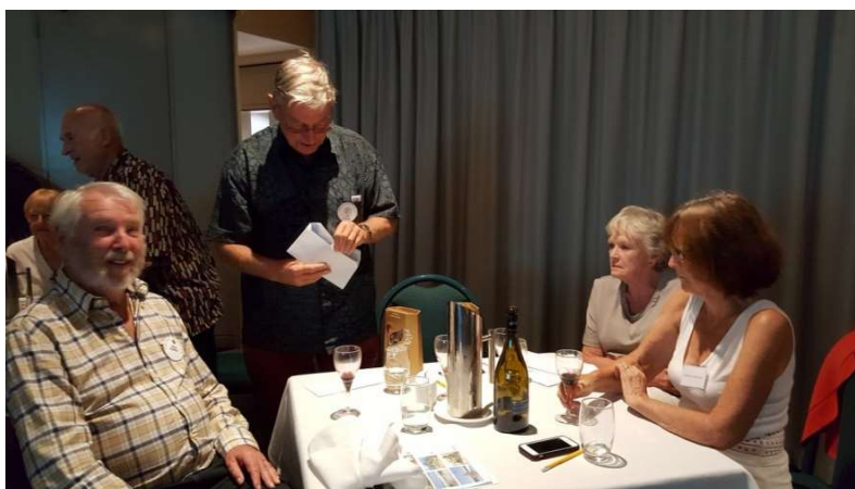
The winning team takes the prize!