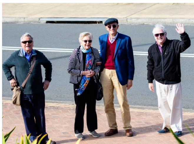
Checking to see if the natives were friendly.

What new adventure awaits our Probus Members? Check out the 2017 Functions & Activities Program below.