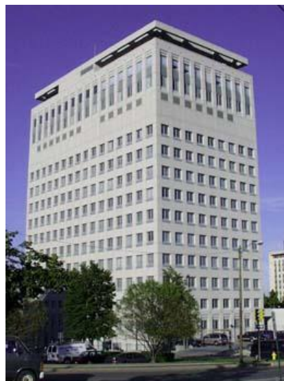
Kiewit Tower in Omaha Nebraska, where Berkshire Hathaway's corporate office is located.