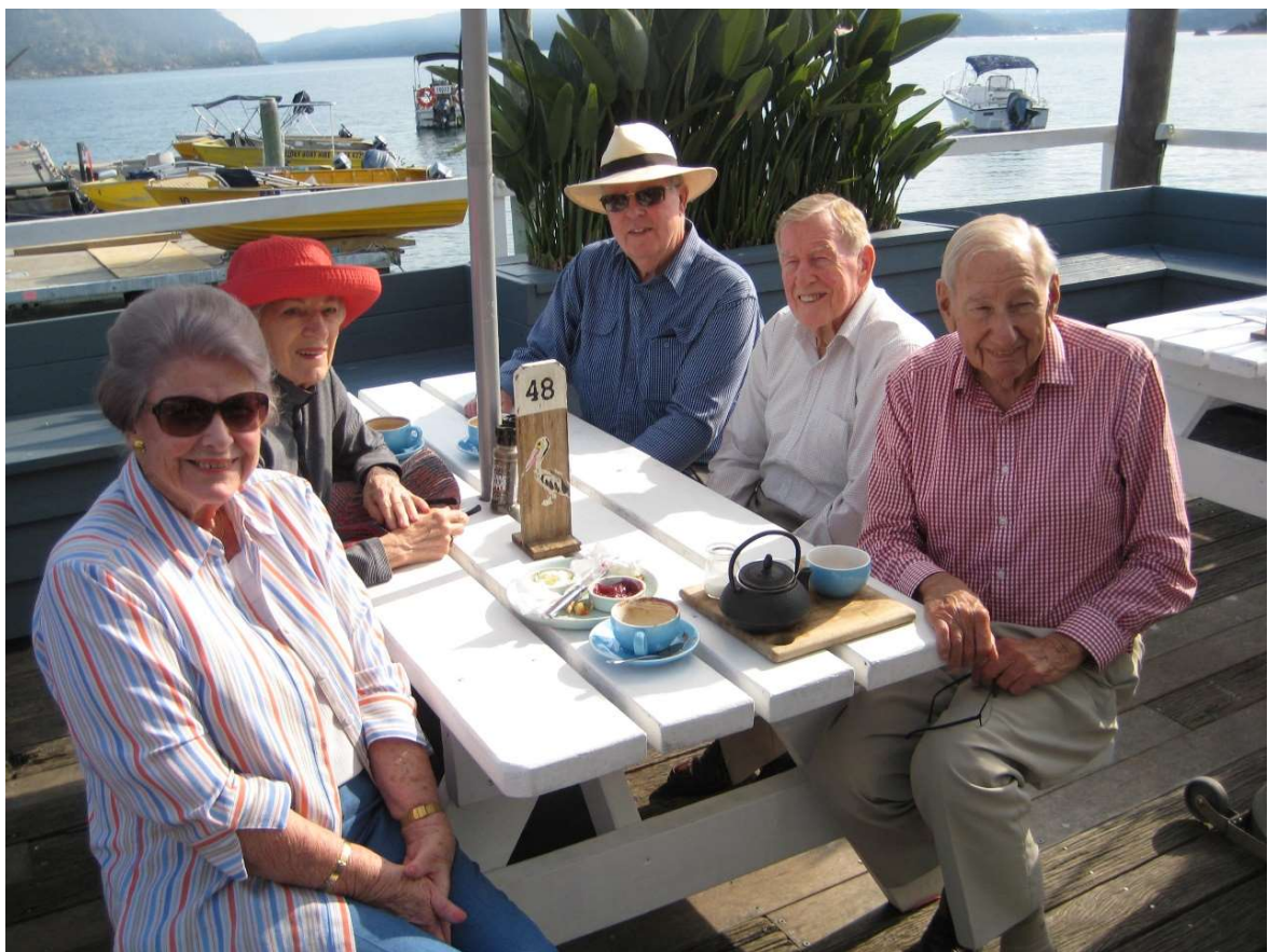
Now these are the future leading stars at the Bay!