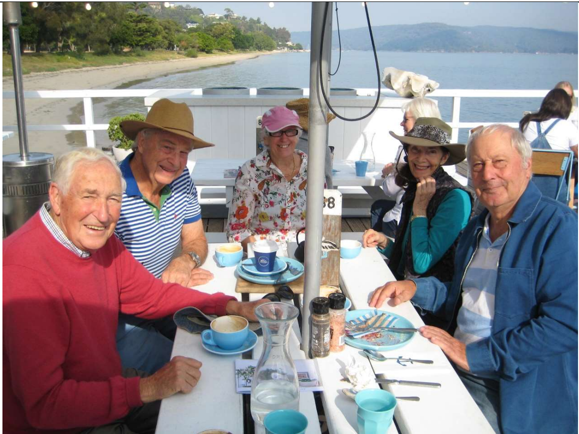
Maybe they could do with a country look to the show?