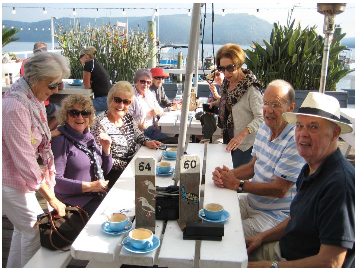
The next generation cast of Summer Bay?

After having quenched their thirst, they walked along Pittwater's Station Beach then crossed over to the surf side of North Palm Beach winding up to the "Summer Bay" surf club also known as North Palm Beach Surf Club. All totally enjoying the beauty of Pittwater.