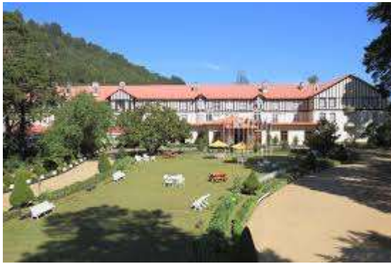
The Grand Hotel, Nuwara Eliya

To quote the tourist brochure: Endless beaches, timeless ruins, welcoming people, oodles of elephants, rolling surf, cheap prices, fun trains, famous tea and flavourful food make Sri Lanka irresistible.