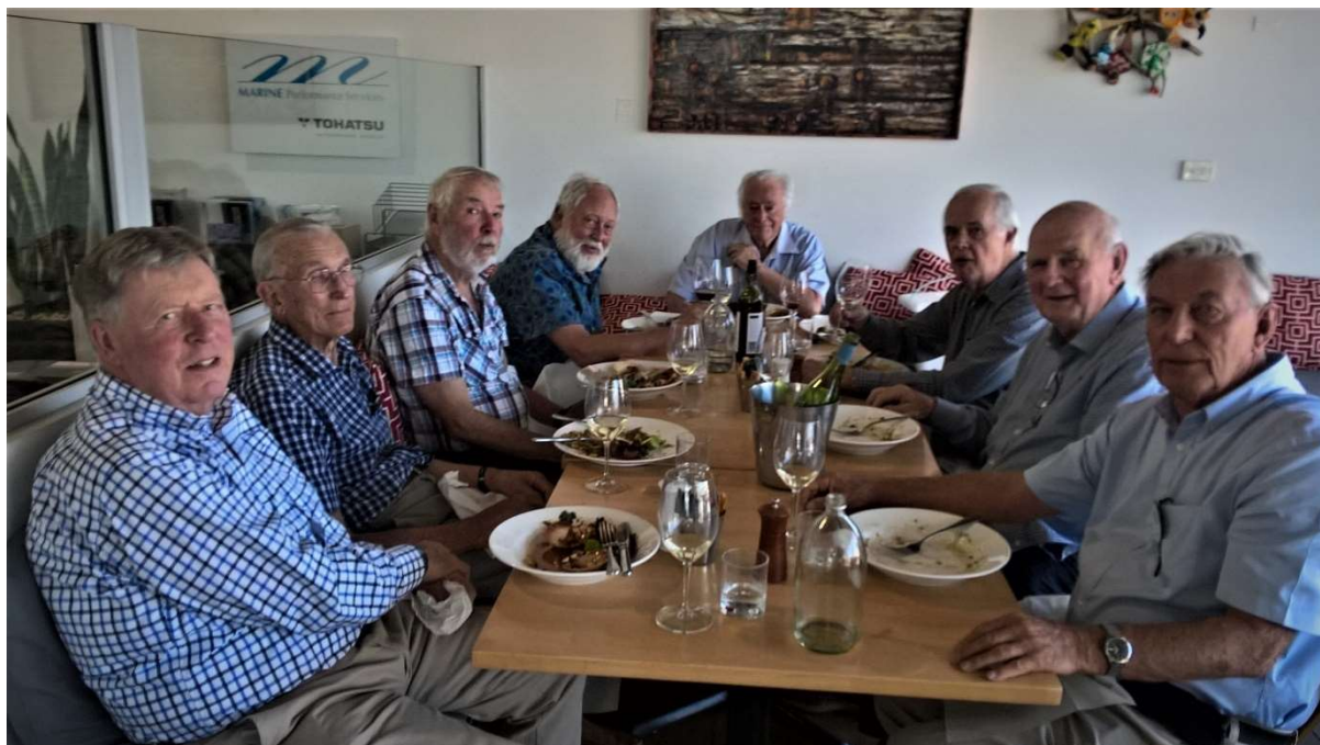
The 'Guiding Hands' of Pittwater Probus over the years.

Seven Past Presidents, one Current President and one President to Be, enjoyed the recent Presidents Lunch at the Marina Café at Church Point.