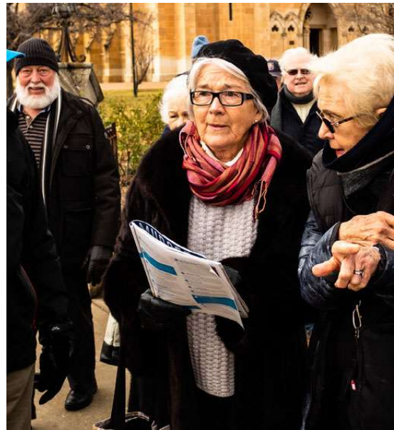
We even had our own Tour Guide in Mudgee.